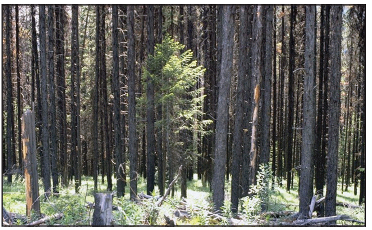
Figure 12. A "high-hazard" lodgepole pine stand, very susceptible to mountain pine beetle infestation.

Management options for mountain pine beetle populations are scale and time-dependent. Options include: 1) short-term prevention techniques, aimed at manipulating beetle populations, 2) long-term