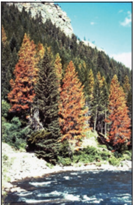
Figure 4. Fading mountain pine beetle-killed lodgepole pines. Trees generally fade 8-10 months after being attacked.