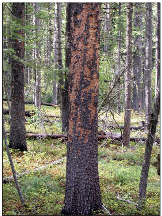
Figure 11. Woodpecker feeding on overwintering larvae typically has little effect on outbreak populations.

Competition. Mountain pine beetle larvae compete for food and space not only with each other, but with larvae of other insect species. For example, larvae of