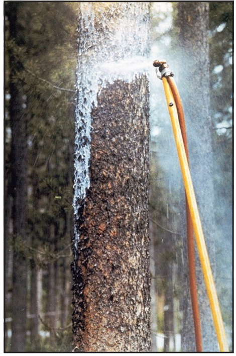
Figure 13. Preventive treatments can successfully protect susceptible hosts from mountain pine beetle attacks.

<u>Pheromones</u>. As noted previously, beetles produce both aggregative and antiaggregative pheromones that are used to manipulate their populations to their advantage. Many of these "message-bearing" chemicals have been identified, and their