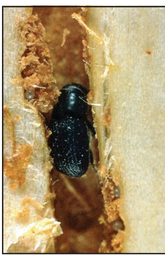
Figure 7. Mountain pine beetle adult and eggs in egg gallery.

significant levels of tree mortality. Eruption to an outbreak population and subsequent widespread tree mortality are dependent on a number of factors, including favorable climatic and stand condi-