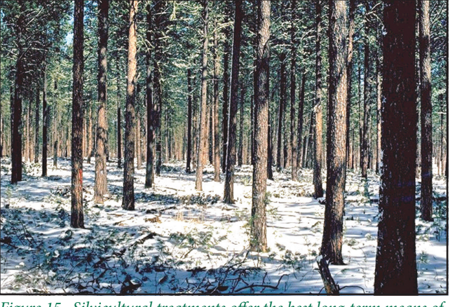
Figure 15. Silvicultural treatments offer the best long-term means of protecting susceptible stands from mountain pine beetle infestation.

Prescribed fire is an additional option for altering stand density to reduce overall susceptibility to mountain pine beetle attacks. However, sublethal heating of critical plant tissue during prescribed burns can stress residual trees, which then may be-