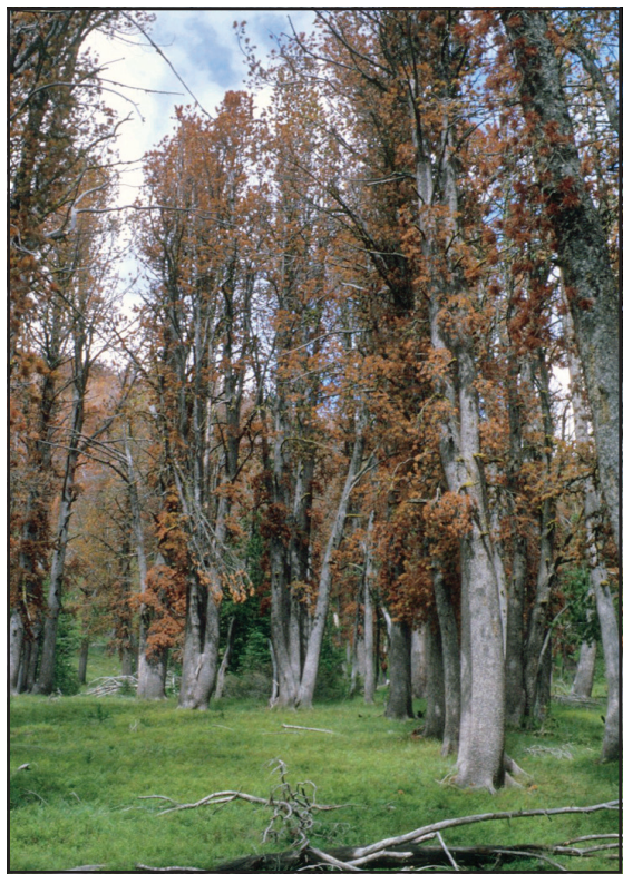
Mountain pine beetle-killed whitebark pine in Yellowstone National Park, 2004.

Mountain pine beetles can reproduce in all species of pine within their range. Outbreaks often develop in dense stands of largediameter (>8 inches), older (>80 years-old) lodgepole pine and dense stands of mid-sized (8-12 inches diameter) ponderosa pine. When weather is favorable for several consecutive years, severe outbreaks can occur in high-elevation stands of whitebark and limber pine. Widespread outbreaks develop over several years and can result in millions of dead trees. Periodic losses of high-value, mature sugar and western white pine are less widespread, but also serious.