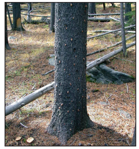
Figure 3: Pitch tubes and boring dust indicative of a successful mountain pine beetle attack in lodgepole pine.

Needles on successfully infested trees begin changing color several months to a