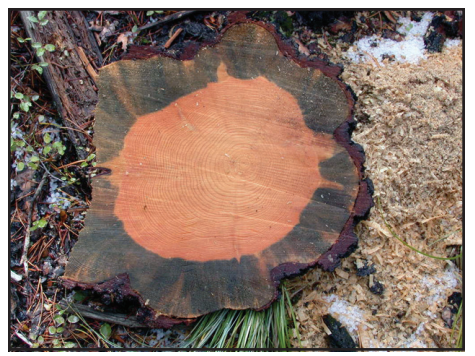
Figure 5. Blue-stained sapwood of a mountain pine beetle-killed tree.

year after attack. In unusually dry years, foliage may begin to fade within a few weeks. Needles change from green to yellowish green, then sorrel, red, and finally rusty brown (Figure 4, see page 3). Fading often begins in the lower crown and progresses upward in lodgepole pine, but may vary somewhat with other hosts. In largediameter, tall sugar pines, for example, upper crown fading may be the first sign of an infestation.