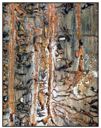
Figure 6. Mountain pine beetle egg and larval galleries.

Eggs may also be laid in late spring by females that survived winter. Surviving females and males may either re-emerge