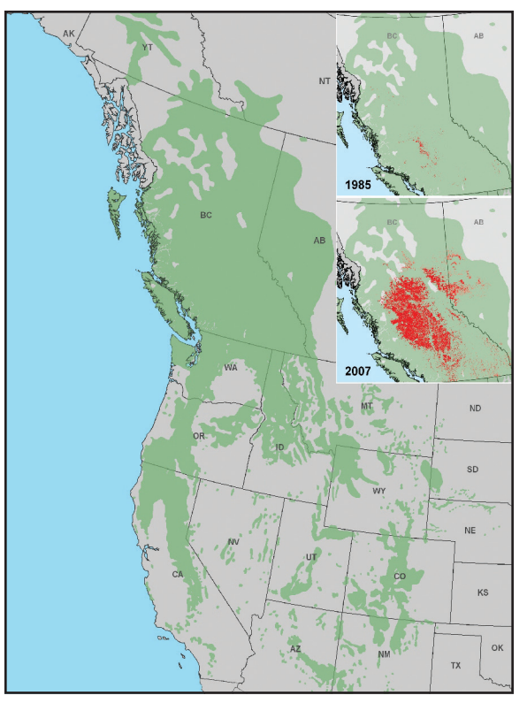
Figure 1. The range of mountain pine beetle generally follows its major host pine species throughout western North America (shown in green). Current range of mountain pine beetle extends from northern Baja California, Mexico and southern Arizona, US to central British Columbia, Canada. In recent years, mountain pine beetle outbreak populations (shown in red) have been found further north into British Columbia and east into Alberta than had been observed in historical records, including an outbreak in 1985.

Major hosts of mountain pine beetle include lodgepole, ponderosa, western white, sugar, limber and whitebark pines. All pine species within in their range, including Coulter, foxtail, pinyon, and bristlecone pines, can also be infested and killed. Scotch and Austrian pines, introduced into North America as ornamentals, Christmas trees and/or forest plantations, are also susceptible to at-