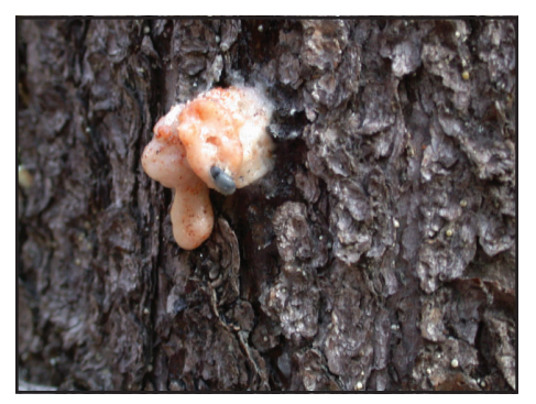
Figure 2: Unsuccessful mountain pine beetle attack—commonly called a "pitchout."

In addition to pitch tubes, successfully infested trees will have dry, reddish-brown boring dust, similar to fine sawdust, in bark crevices along the tree bole and around the tree base (Figure 3). Infested trees may also have boring dust but no apparent pitch tubes. These trees, referred to as "blind attacks," are more common