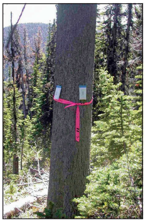
Figure 14. Verbenone can be an effective preventive treatment in some situations.

Synthetically produced pheromones are registered and periodically reviewed by the U.S. Environmental Protection