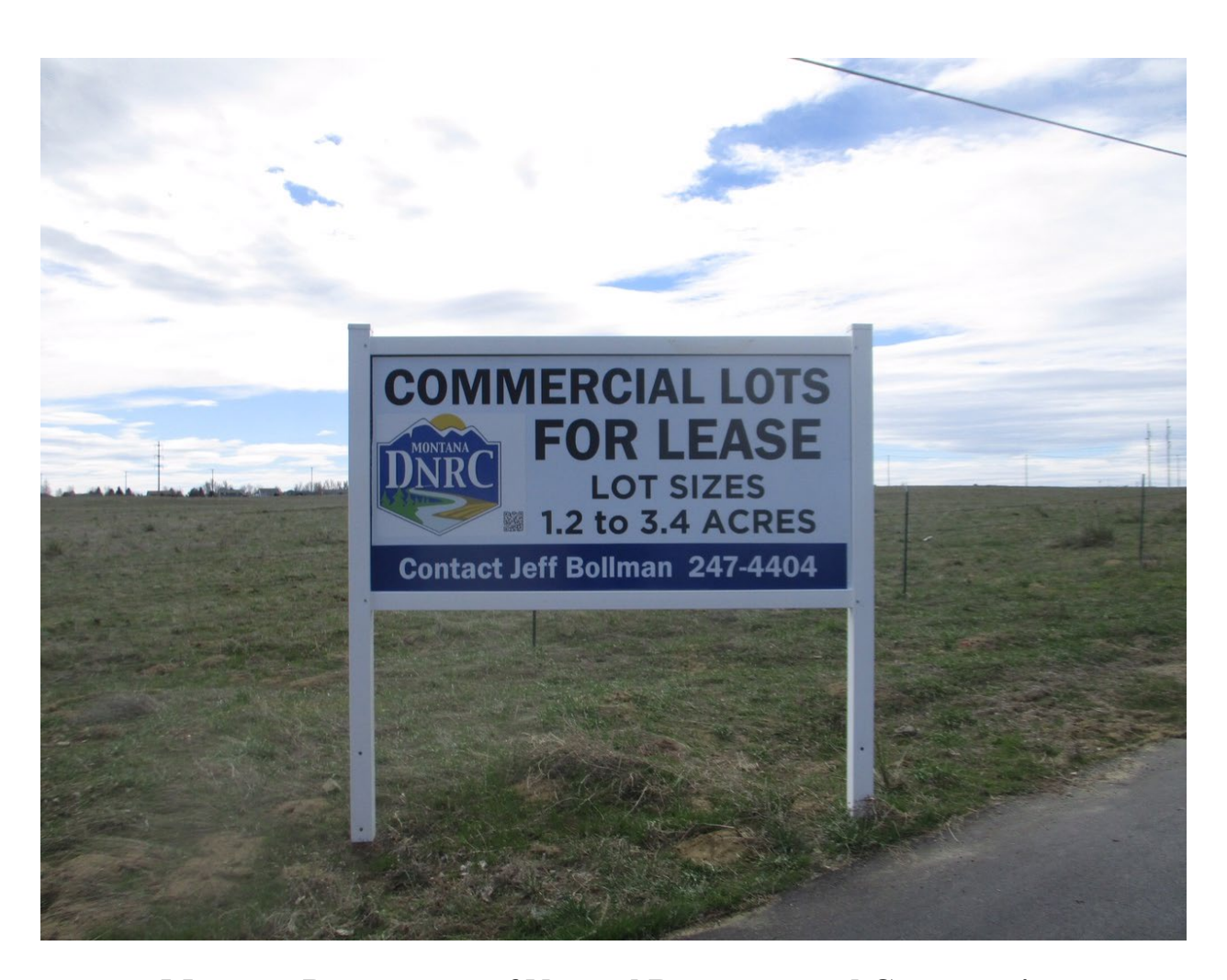
Montana Department of Natural Resources and Conservation November 23, 2022